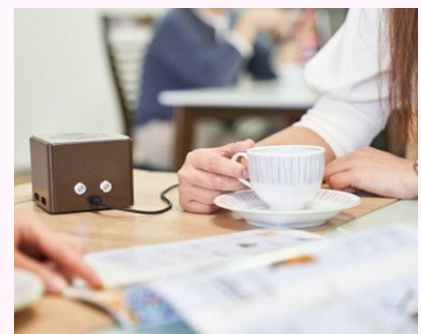
In coffee shop