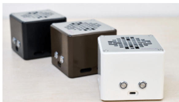
Body Color: Black, Brown, White

DUE TO CONTINUOUS PRODUCT IMPROVEMENT, THE DESIGN AND TECHNICAL SPECIFICATIONS ARE SUBJECT TO CHANGE WITHOUT PRIOR NOTICE