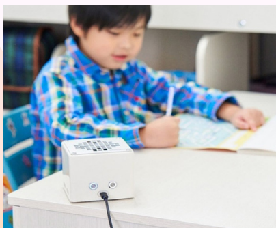
At study desk